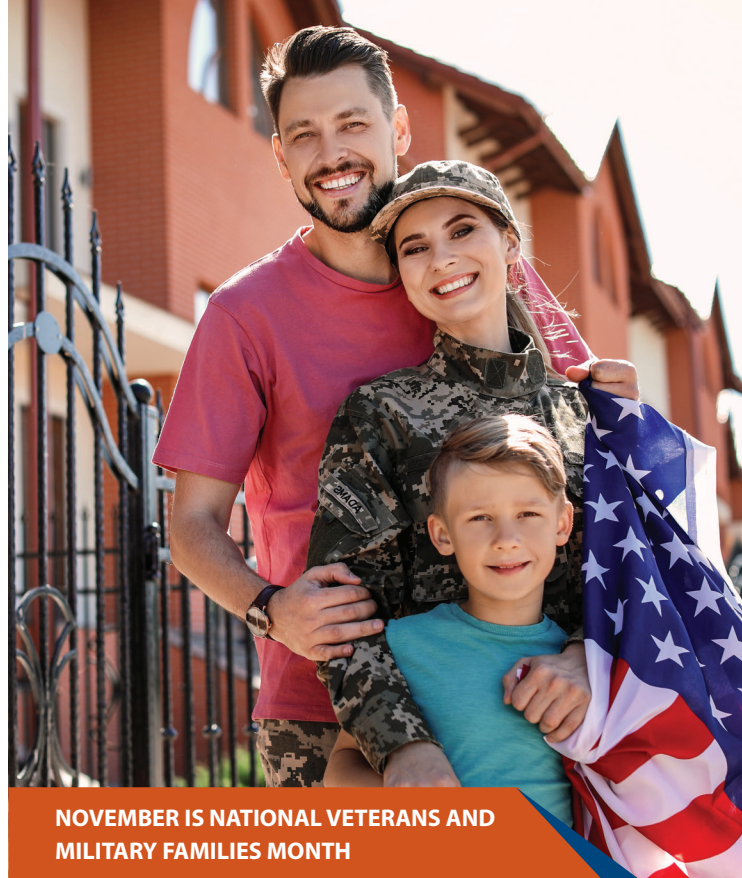
NOVEMBER IS NATIONAL VETERANS AND MILITARY FAMILIES MONTH